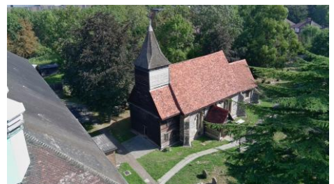
The Old Church