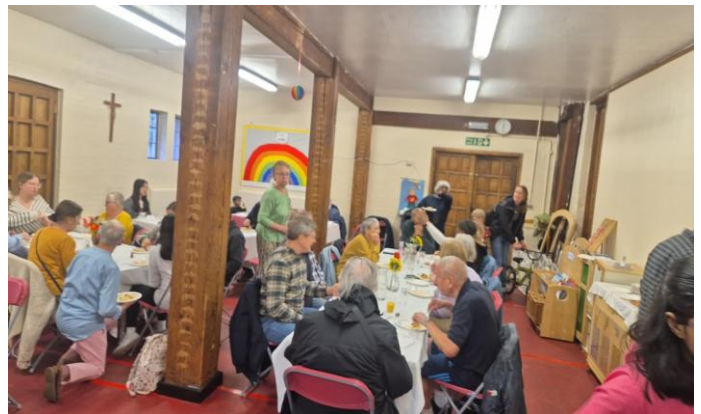
Celebrating Holy Cross Day in the Parish Room

Are you the person we're looking for? Can you help us to deepen our faith, celebrate our diversity and grow our congregation?