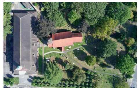
The two churches are next to each other

The churchyard has been closed for some years and since 2010 it is maintained by Ealing Council. There is a garden of remembrance set aside for the burial of ashes.