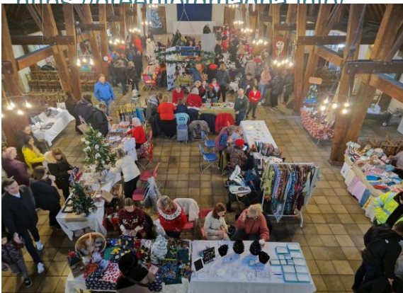
Christmas market in the New Church